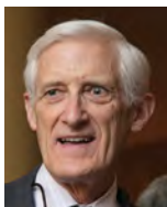
Hon. Wynne S. Carvill Superior Court of Alameda County